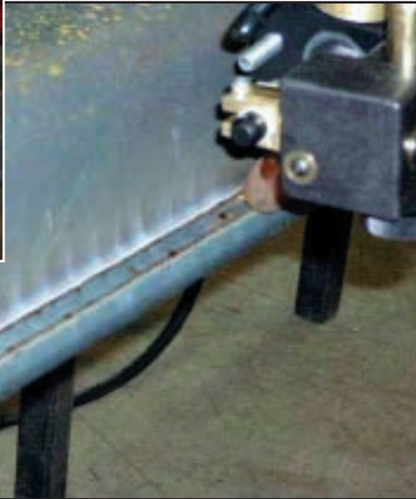
Below: Gullco Kat-Trackers continually sense the slightest variation across the weld seam and automatically correct the position of the weld torch.

Weld accuracy and quality are dependent on precise seam tracking and a reliable electrical interface of all