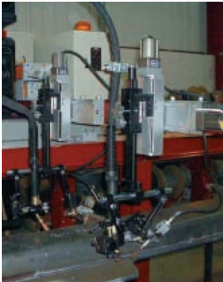
Left: Gullco Kat-Tracker probe with replaceable tip can be seen in the bottom left of the photo. They are precisely positioned relative to the torch prior to operation using a micro-cross-slide.