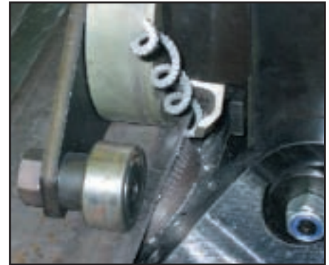
Above/Below: GBM-28-U produces clean machined bevells on the underside of plate at up to 2 meters per minute using the rotary shear method of metal removal.

section plates at 2m/min. This rugged beveller with adjustable bevelling head can produce bevel angles 22 1/2° through 55°. The rotary shear principle incorporated by this machine results in low noise/vibration and high speed operation. This GBM-28-U unit bevells the under side of the plate.