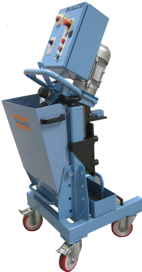
PLATE EDGE BEVELLING MACHINE - KBM@50

Adjustable bevel angle between 15° - 60°