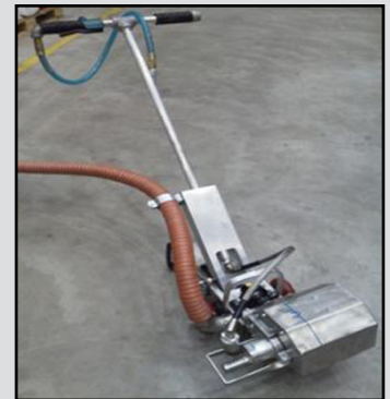
PLATE BEVELLING MACHINES

The standard plate resurfacing unit can be integrated with a handle and undercarriage to allow for it to be pushed along the top of large plates. The standard air motor, abrasive belt, carriage wheels, muffler and lubricator can all be used providing a versatile unit which can be applied to a variety of surface preparation applications.